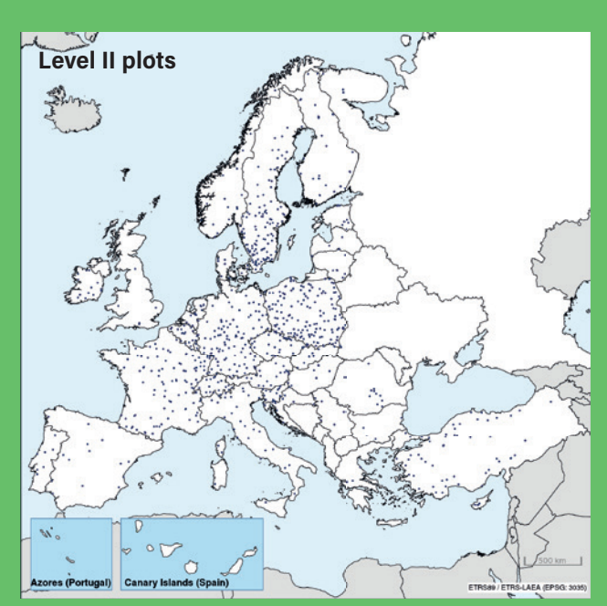
Distribution of Level II plots temporarily active between 2000 and 2016. Around 600 plots are currently active