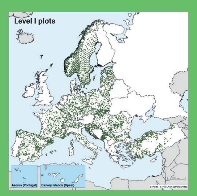
Distribution of Level I plots in 2016. Around 5000 plots are currently active