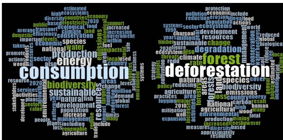
Fig. 2. Search terms consumption (2a) and deforestation (2b) and the most frequent terms found in the same paragraphs across all analysed documents. Word sizes are proportional to the frequency of used words.

agriculture, timber, logging, wood and charcoal, whereas terms such as commodities, export or trade are not contained.