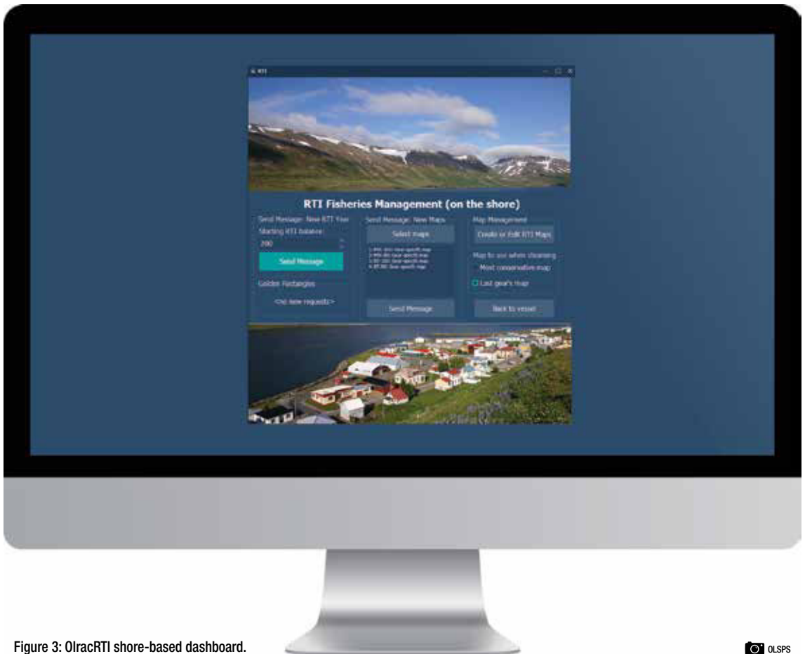
Figure 3: OlracRTI shore-based dashboard.