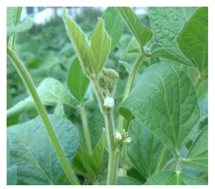
Soybean flower.

Hierarchical richness index (HRI): comparative assessment index of the dominance of different organism groups calculated from abundance scores.