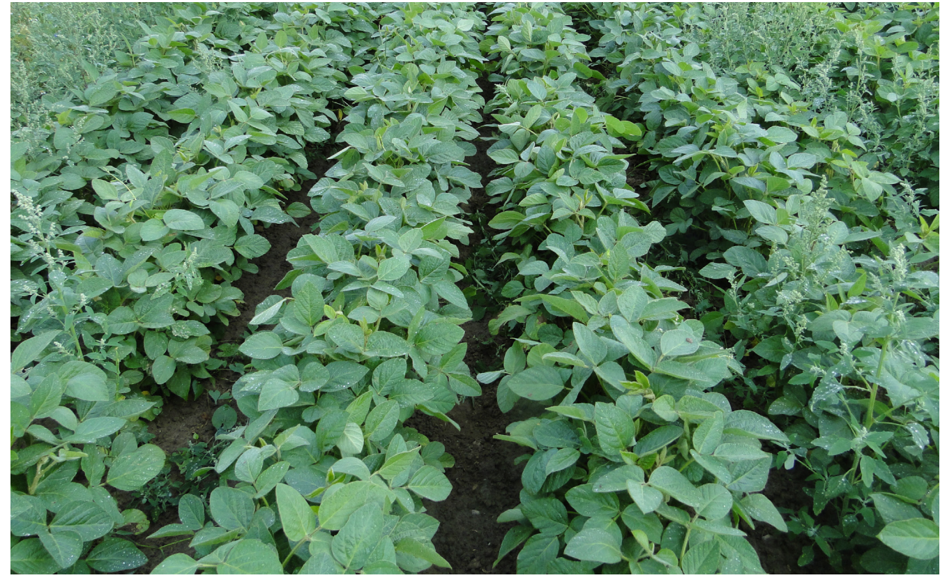
Soybean grown in a field experiment, Müncheberg, Gemany.

Many agroecosystems are biodiversity-depleted ecosystems. The expansion of arable land and the intensification of its use has displaced natural habitats and reduced the biodiversity of entire landscapes. Since agriculture dominates land use over most of Europe, increasing on-farm biodiversity is a challenge for policymakers, scientists and land managers. Securing and enhancing the amount of semi-natural habitats, strips, intercropping (polyculture), flower extended crop rotations, the use of perennial crops, organic farming, and the increase in the production of biodiversity-enhancing arable crops are all relevant approaches. The positive impact of perennial forage legume species on agricultural habitats is well documented. Less is known about the effects of grain legumes. The question addressed here is what we can