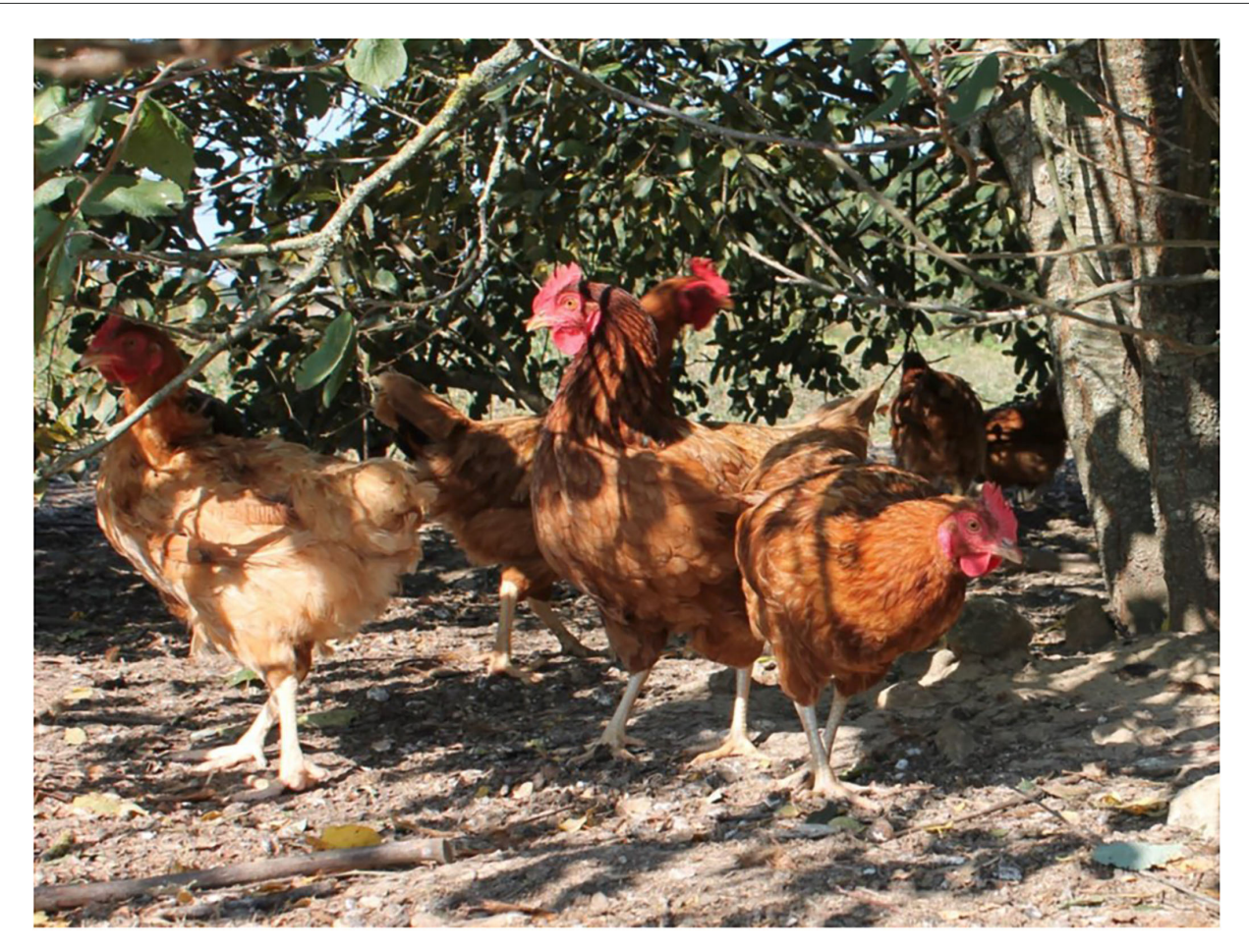
FIGURE 2 Hens under bushes creating a fresh microclimate.

behavior, comfort behavior (resting, dust and sun bathing, wing stretching), feeding behavior (catching snails, insects, eating leaves), running, playing, etc. Moreover, hens using the outdoor area have less plumage damage, indicating less feather pecking (75) and the use of the range has implications on some health variables (8). The use of the range raises many questions since it may not be used enough if it is not attractive enough for the hens or it may get damaged by crowding and intensive use if it is not designed to facilitate the use of the whole range area (76). As a consequence, range use and range management are issues that were mentioned by key informants in each country. Feather pecking was also mentioned as a behavior issue by key informants.