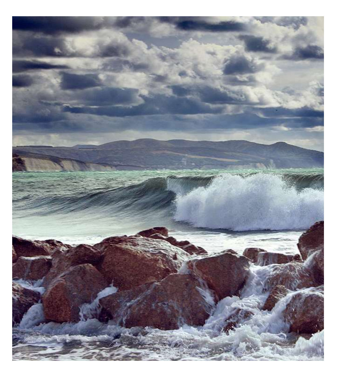
ICES INTERNATIONAL COUNCIL FOR THE EXPLORATION OF THE SEA CIEM CONSEIL INTERNATIONAL POUR L'EXPLORATION DE LA MER