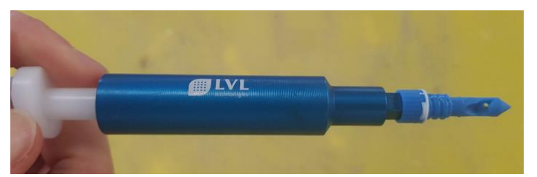
Figure 3. The GST in place on the manual decapper tool, which functions as a handle.