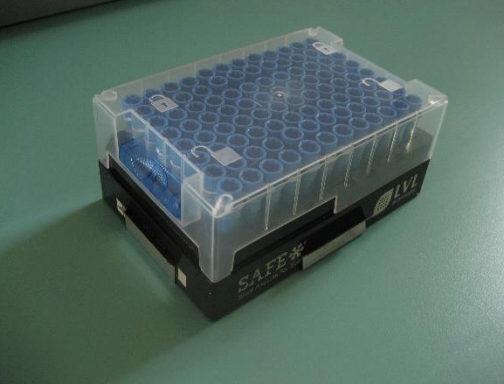
Figure 1. A rack bracket can be securely fixed to any suitable work surface and will prevent accidental spillage of the sample tubes when working onboard research and commercial vessels.