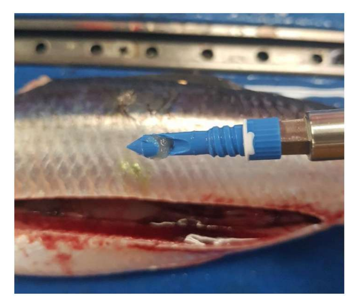
Figure 3.5.1. An extracted Genetic Sampling Tool (GST) showing the tissue sample retained within the sample collection window. See Annex 6 for further illustration and operating procedure.

Twenty-five herring in total were randomly assigned between each of the treatments and standardised genetic tissue samples were taken (using the GST described above) at intervals of 2, 4, 8, 12, 18 and 24 hours. All genetic samples were genotyped by IdentiGEN for the 45 SNP panel used in the discrimination of 6a herring. The results showed that almost all the samples worked well. Only one individual had less than 80% of the genotypes and the majority were over 89% (40/45 successful genotypes), which is the threshold for baseline samples. No patterns were apparent within treatments in terms of the return of genotypes. Further statistical analysis is required but everything suggests that sample quality is not adversely affected by storage and handling in the 24 hours prior to tissue collection. Previous issues may therefore have been caused by cross-contamination, something which has been alleviated by the adoption of the GST.