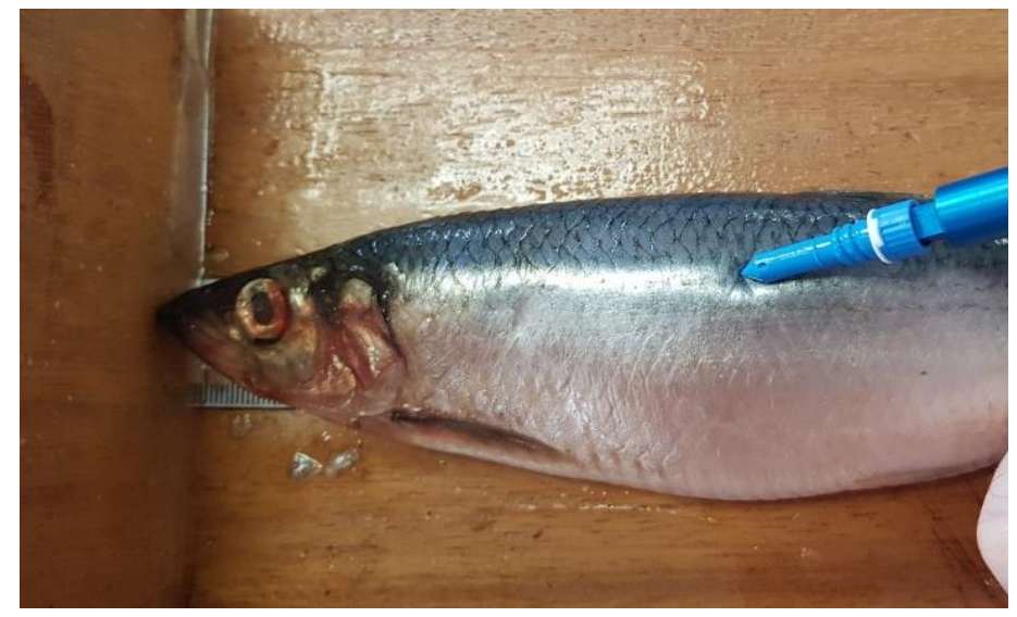
Figure 5. With the sample collection window facing down towards the fish insert the GST at an angle of 45° into the dorsal musculature up to the stop line.