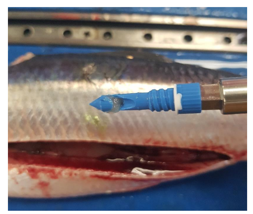
Figure 6. The extracted GST showing the tissue sample retained within the sample collection window.