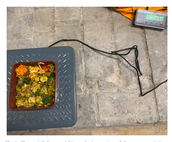
Fig. 1. Electronic balance weighing a plastic container of plate waste consisting of mixed vegetables.

In waste composition analysis, different food waste components, such as pasta, chicken, vegetables, and bread, were sorted by hand into plastic containers. On the first day, degree of separation of the plate waste was decided. Complete separation was not possible due to some waste being in liquid form (e.g., sauces) and mixed form (rice with tiny pieces of vegetables). In such cases, sauces and inseparable vegetables were categorized as the main component (see Table A.2 in Appendix for a complete list of waste component categories). The plate waste was categorized into edible or inedible food waste, where inedible food waste comprised fruit peel and cores, and eggshells. Occasional napkins and spread packages that had accidentally ended up in the food waste bin were separated out into the category other. After the sorting process, the plastic containers containing the various plate waste components were weighed one by one, using a tare function on the electronic balance in between each weighing. The waste category with the largest volume, usually the staple food component of the day such as rice or potatoes, was left in the plastic bag for weighing. The mass of the plastic