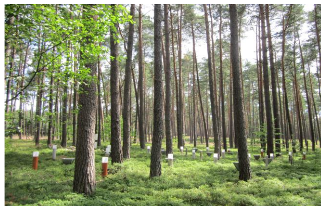
Figure 3: Pine experimental plot from the Level II program

The project investigates to what extent the patterns of (bio-) acoustic activity are related to the results of the Level II measurements and the National Forest Inventory and National Forest Soil Inventory.