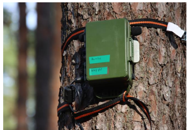
Figure 1: Sound recording device for the audible range

Commercial acoustic recording devices are used for recording in the audible range. These devices record environmental sounds every tenth minute. Other recording devices are used to capture bat calls in the frequency range that is not audible to humans. The continuous operation of the recording devices produces approximately one terabyte of data per month. Handling these massive amounts of data is a technical challenge.